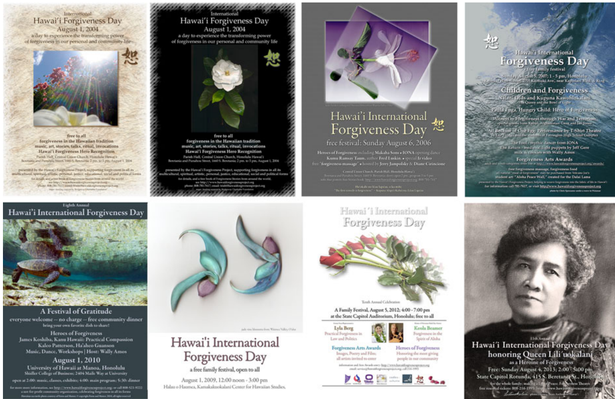
Posters Past: selected from the first 11 years of festivals by the Hawai'i Forgiveness Project

Sincere thanks to the good people at Chaminade University, to our Silence Guides, and to the hundreds of people and scores of organizations who provide their selfless support. Full details at http://www.hawaiiforgivenessproject.org , or call 521-9222.